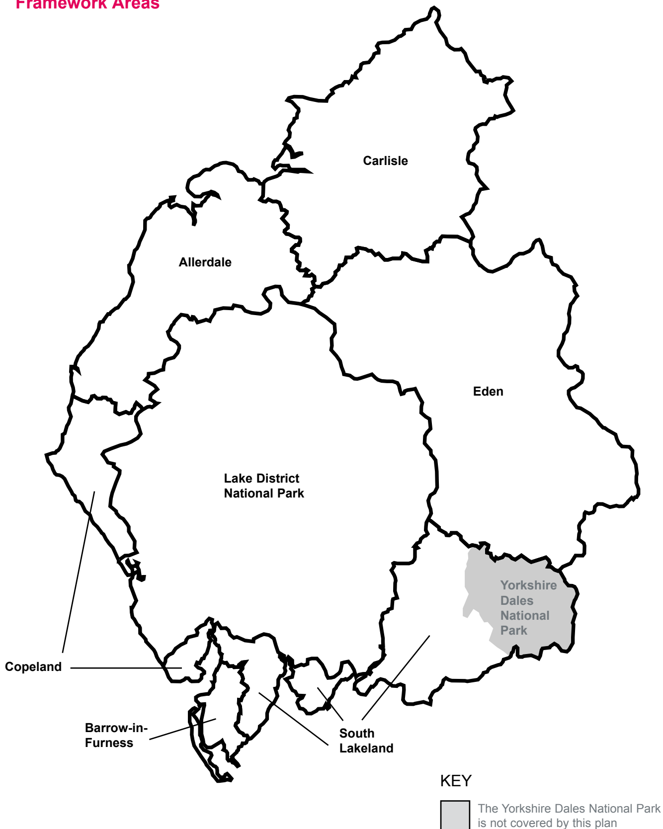
Figure 1 Local Development Framework Areas