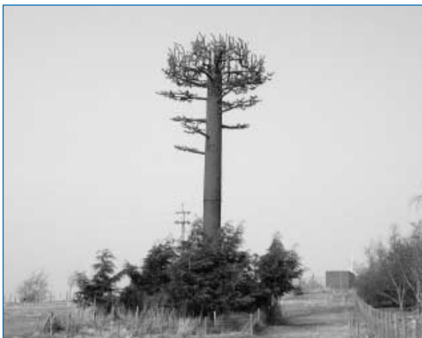
Mast disguised as tree, Cockermonth.