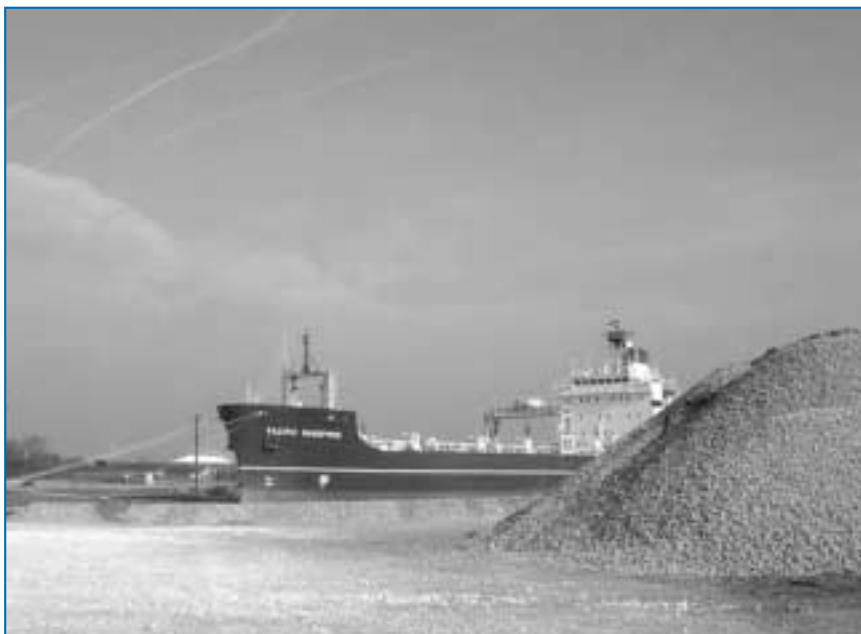
Port Facilities for Freight, Barrow Docks.